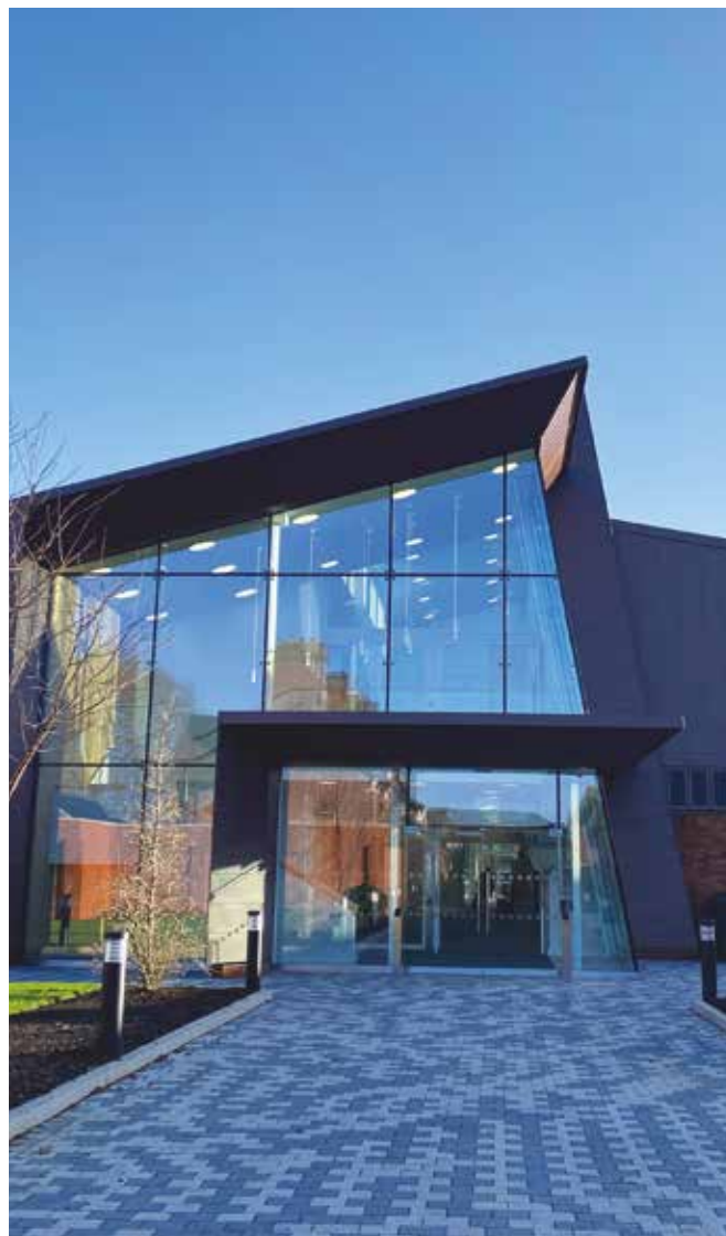
New Science Centre

Currently there are excellent career opportunities for physicists and engineers. There is much useful and relevant information in the Careers Library. Pupils and parents are very welcome to discuss any questions that they might have about studying Physics at Lord Wandsworth College, at University or the career opportunities that are open to those who have studied Physics.